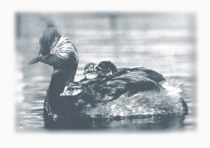
Eared Grebe with young

In the shorebird department, there were excellent comparative views of juvenile Baird's sandpipers with Westerns, and a handful of Leasts. Amazing were more than a hundred White-faced Ibis. A few Willets, many Eared Grebes, some with fledgelings on their backs, many nesting Western Grebes, one nesting Clark's Grebe. Many Gadwall with young. Thousands of waterfowl. Also in great numbers were American White Pelicans and Canada Geese.