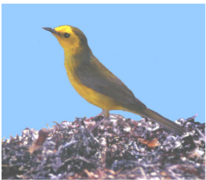
Female Hooded Warbler

The hundreds of hours of birding resulted in Invo County receiving National Recognition again! And again, as the second birdiest inland county but this time second to our neighbor to the south...Kern County! Just think what the possibilities would be if the lower Owens River was flowing and we had a few dozen more indefatigable birders!