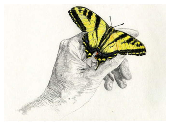
Tiger Swallowtail - drawing by Joy Fatooh

When the weather warms up and the flowers bloom again, there will be more on the wing than just the birds. Learn about the ecology, conservation and basic identification of some of these other winged wonders, with a focus on the common butterflies of the Eastern Sierra. Paul is the director of Friends of the Inyo, a group working to preserve the public lands and wildlife of the Eastern Sierra.